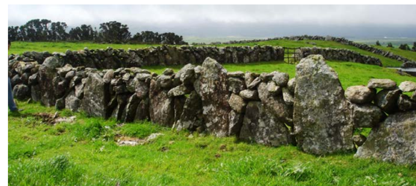
Figure 3. The 'dry stone' walls show the larger stones enclosed in smaller ones.

m a.s.l. From a geomorphological point of view, it consists of six units (Fig. 2): the Cinco Picos volcano, the Guilherme Moniz volcano, the Pico Alto volcano, the Santa Bárbara volcano, the fissural zone and the graben of Lajes (Zbyszewski et al. 1971; Self 1974; Queiroz et al. 2001; Nunes 2000a and 2000b).