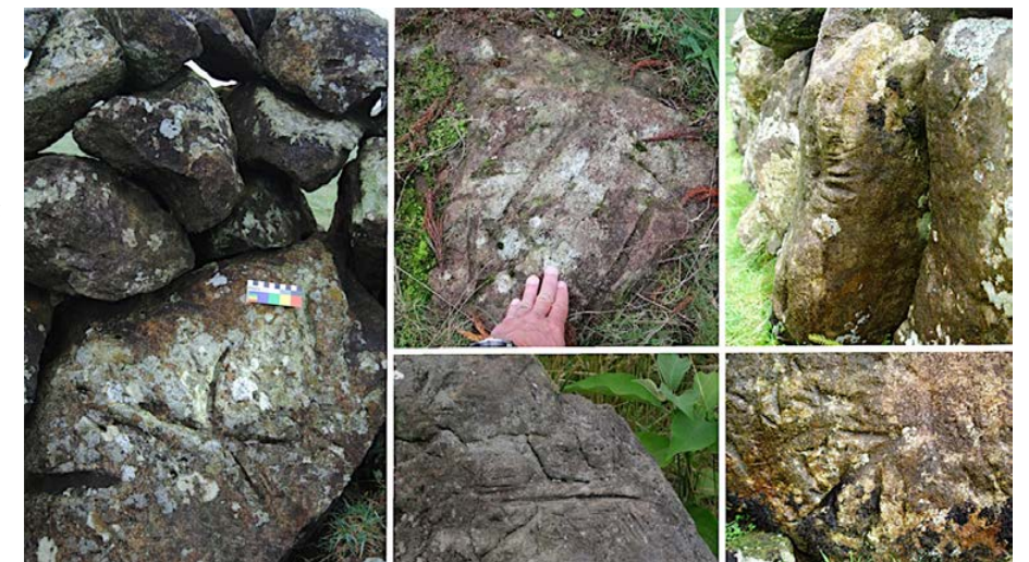
Figure 4. Different types of grooves, of variable size, isolated or overlapping, linear or sinuous.

Particularly interesting is that most grooves occur on medium hardness trachytic and trachyandesitic rocks while being apparently absent in the other lithologies. These high-silica rocks of comenditic and pantelleritic composition are particularly abundant in Terceira Island, formed essentially by feldspars. They result from long effusive episodes of siliceous nature, forming domes and lava coulées, characteristic of the Terceira volcanism (Self 1976, in Larrea et al. 2019). However, we still ignore whether these rock grooves also occur on the other Azorean islands, where no