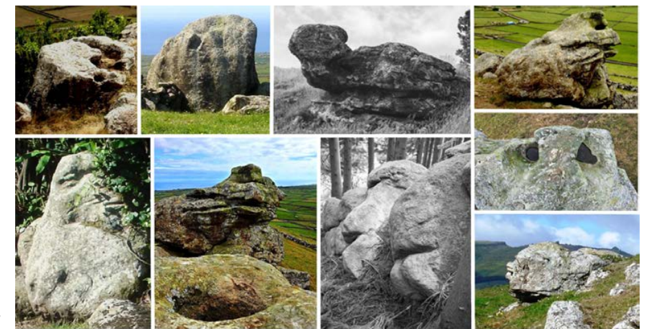
Figure 10. Zoomorphic figures usually localised on the board of some calderas.

Grooved stones like those of Terceira Island were reported and depicted by Bednarik et al. (2007) and Shepherd and Jolly (2016), these authors showing grooves with shapes and depths essentially similar to those found in Terceira Island. Shepherd and Jolly describe the numerous explanations for the origin of such rock markings proposed by academic experts, both geologists and geomorphologists and even experts in rock art. Although some of these scientists thought those marks might have a geological or geomorphological explanation, they were unable to find arguments for a natural origin, having put aside the hypotheses of their being fossils of plants or animals, ichnofossils, abnormal stratification, glacial stria-