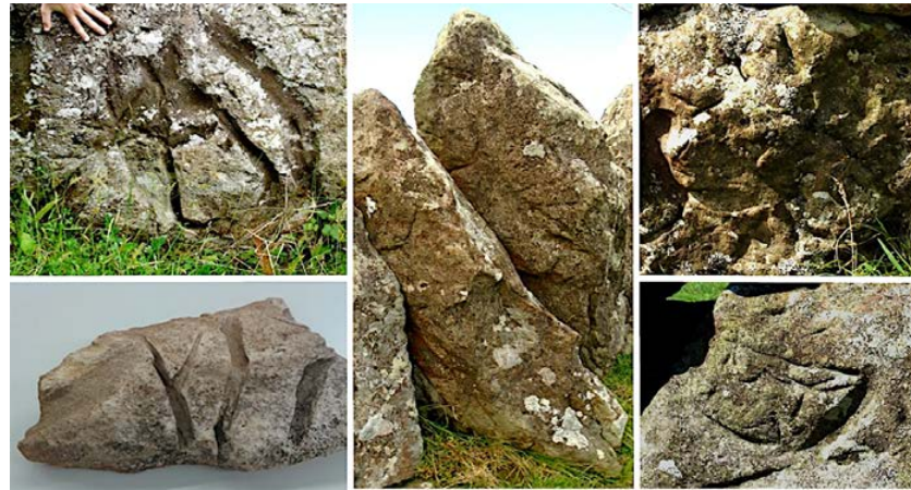
Figure 6. Different types of grooves, of variable size, isolated or overlapping, linear or sinuous (photos A. Costa and TA).