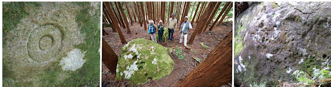
Figure 12. Concentric circles petroglyph, cupules and potential cupules.

ties to the symbol of the goddess Tanit, cupules, cut marks, concentric circles, boats, dragons, snakes and other zoomorphic figures, it is plausible that the ancestral inhabitants of the island, when observing these strange and unknown grooves, might have considered them as something magical and sacred, taking advantage of their tracing to carve out forms of their own (Fig. 12).