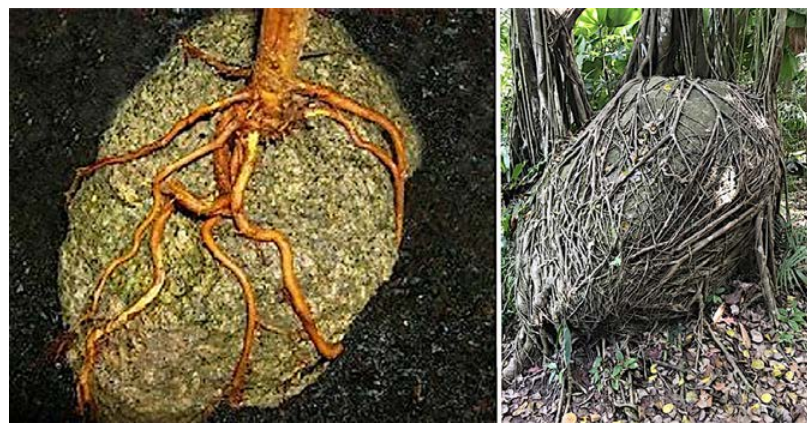
Figure 11. Tree roots 'hugging' stone blocks (