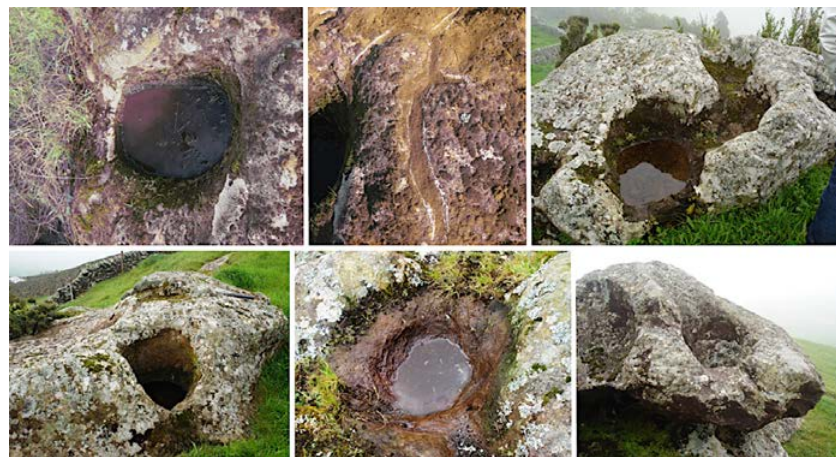
Figure 7. Several types of rock basins.