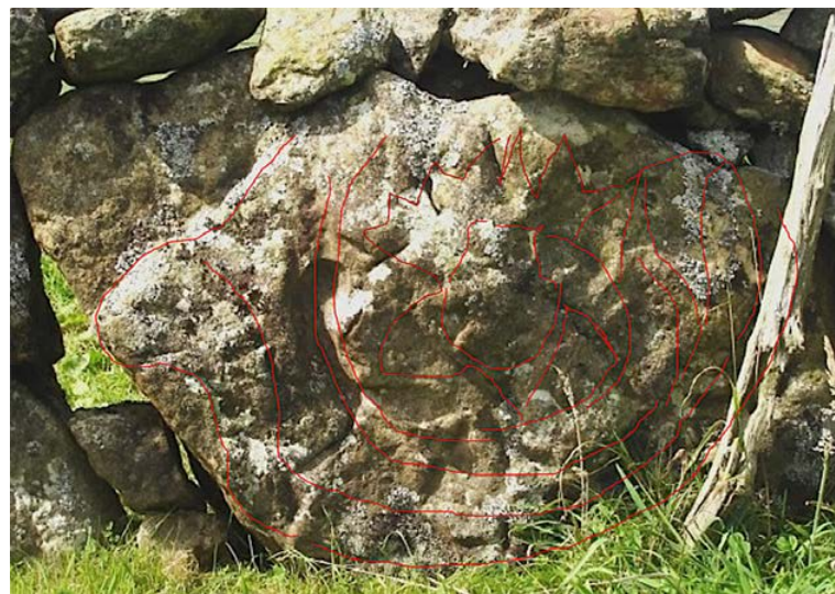
Figure 8. Intricate drawings of figures in which A. Costa distinguished boats and dragons. However, the photo can lead to different interpretations when looking at it.

They may or may not be associated with cupule-like depressions and inscribed on the outer walls of hundreds of 'sinks' (rock basins), also present in the areas referred to (Fig. 7).