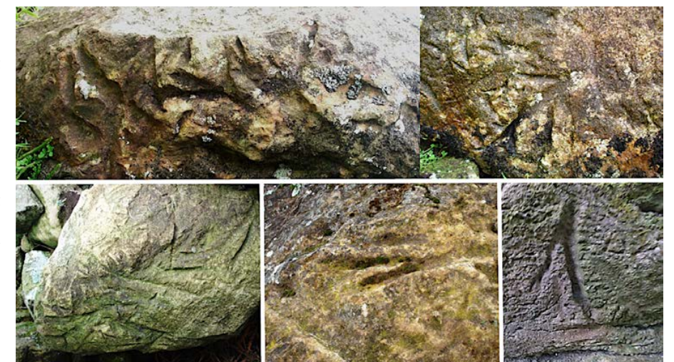
Figure 5. Different types of grooves, of variable size, isolated or overlapping, linear or sinuous. Note the claw and Y shapes.