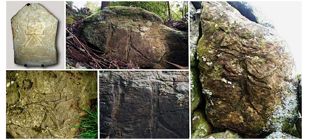
Figure 9. Symbol of goddess Tanit and engraved blocks displaying 'human' figures.

Although the veracity of this account written by an eminent Azorean historian, priest and humanist has never been questioned, the truth is that the people who inhabited the islands before their 'discovery' by the Portuguese in 1427 are never mentioned in the official history of Portugal, and few will have knowledge of them. Remarkably, the bullfighting tradition is ancestral in Terceira Island, where several ganadarias (bull ranches) are active, still feeding